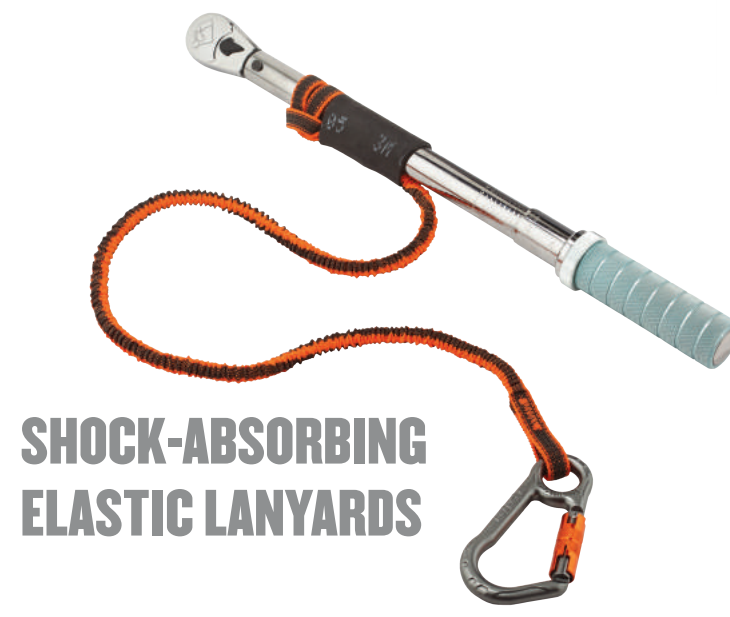
SHOCK-ABSORBING ELASTIC LANYARDS

Once all tools have an attachment point, choose the appropriate tethering solution.